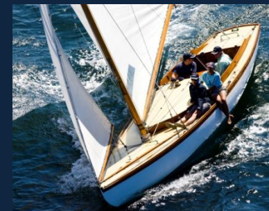
Corey Silken Photos