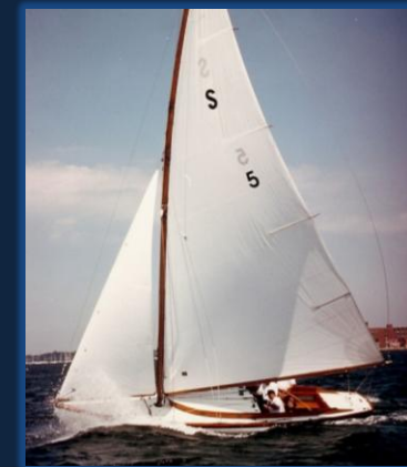
SURPRISE taking first place at a recent Herreshoff Classic Regatta

17 th Annual Leukemia Cup Regatta, Newport: June 4th NYYC Annual Regatta, Newport: June 11-12th Tiedemann Classics, Newport: July 2-3rd Classics at Larchmont, NY: July 16-17th Opera House Cup, Nantucket: August 21st Herreshoff Classic Regatta: August 26-28th Museum of Yachting / Panerai Classic Regatta: September 3-4th Sail for Hope Regatta, Newport: September 9 - 11th Indian Harbor YC Classic Regatta, Greenwich: September 17-18 th Greenport Classic Report, Greenport NY: 24th Heritage Cup Regatta, Hempstead, NY: October 2nd NYC Classics Week, New York: October 7-10th