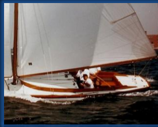
27-ft SURPRISE "S" 1930

Full-day of sailing including two 4-hr charters - select two classes: 12 ½, Fish, S-Boat, and Fishers Island 31.