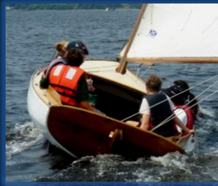
20-ft BLUE FISH 1916

Half-day charter including 2 hrs on a 12 ½ and 2 hrs on BLUE FISH / Fish Class sloop, including ½ hour sailing lesson.